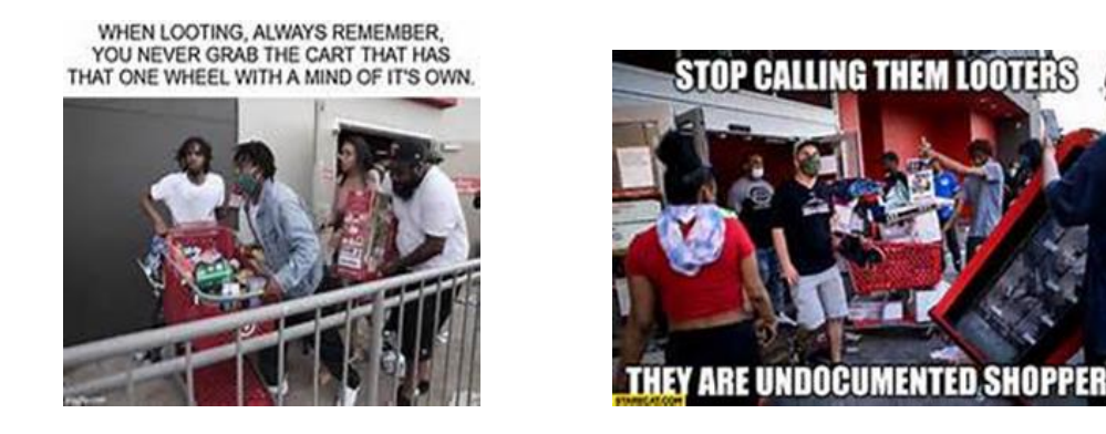
Figure 7. Floyd-themed memes with a counter narrative