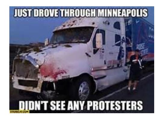
Figure 3. Morality-themed memes

Memes in this category also judged the morality of protesting at sporting events. Several memes in our sample featured images of Kaepernick or other individuals taking a knee in a sports arena--presumably in support of the BLM movement (Figure 4). For instance, one meme in this category, features an African American soccer player kneeling on the field before an unidentified game. We coded this meme as a morality-themed meme because the individual is kneeling in protest and presumably in support of the BLM movement. (We see the man on one knee with his head down showing his support.) The