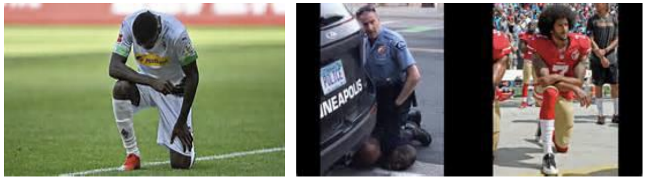
Figure 4. Morality-themed memes

Memes noted that Kaepernick also urged other athletes to participate in the protest in support of the BLM movement. As such, this photo illustrated this athlete's participation in the fight against police brutality. This meme plays right into the Kaepernick-themed meme category, as it illustrates how the community of athletes banded together to show support for an important social movement. By doing so, it aims to spread awareness and encourage thoughtful conversations on unarmed black people police officers have killed. This meme highlights the movement Kaepernick started and promotes the importance of the movement.