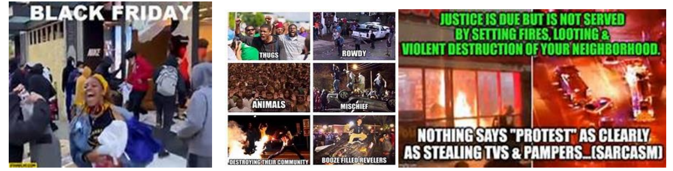
Figure 8. Protest-themed memes

Meme makers contributed to that perception by posting memes suggesting Black people are thieves and not so smart looters. For example, one widely circulated meme featured some masked young Black people with shopping carts leaving a store with a caption that read "WHEN LOOTING, ALWAYS REMEMBER YOU NEVER GRAB THE CART THAT HAS THAT ONE WHEEL WITH A MIND OF IT'S OWN."