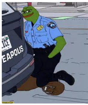
Figure 5. Morality-themed memes

The challenge perpetuated by the memes in this category is they had the potential to create or feed into a trend that might support or encourage the mocking of George Floyd's death. The memes in this category also have the potential to create a negative connotation around the BLM movement and influence others to participate in similar activities in an effort to make light of an otherwise serious situation. With social media challenges, individuals tend to get involved by filming the suggested activity and posting photos on social media platforms to elicit reactions from viewers. Once the challenge catches on, more people participate in the suggested activity and cause a trend to take root. Since the death of Floyd was a major topic of conversation across all media platforms, the memes in this category had the potential to steal attention away from the BLM movement and sway the conversation elsewhere.